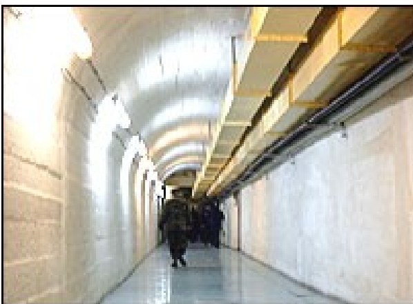
Crna Rijeka underground facility