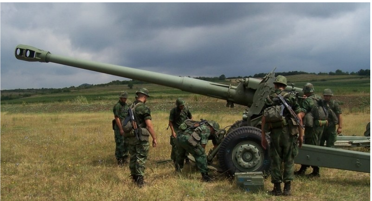
M84 Nora-A 152mm