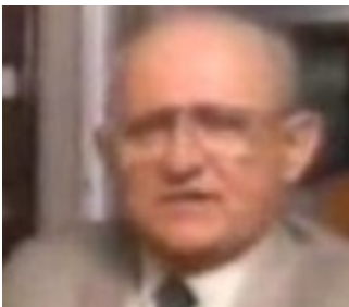
Admiral Branko Mamula, Chief of the General Staff (1979 to 1982), Minister of Defense (1982 to 1988), mastermind of the „Jedinstvo“ plan