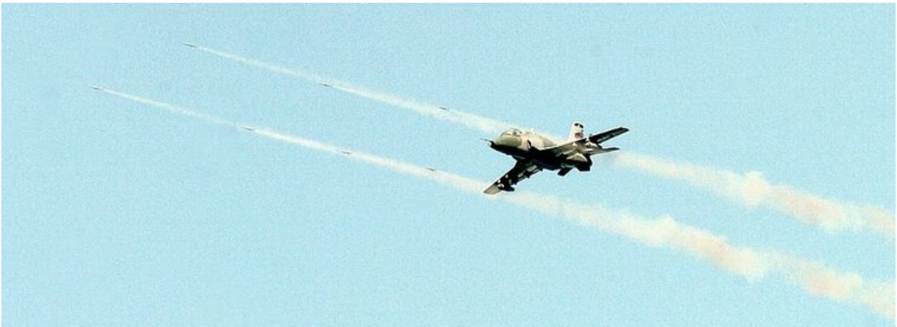
G-4 Super Galeb in combat