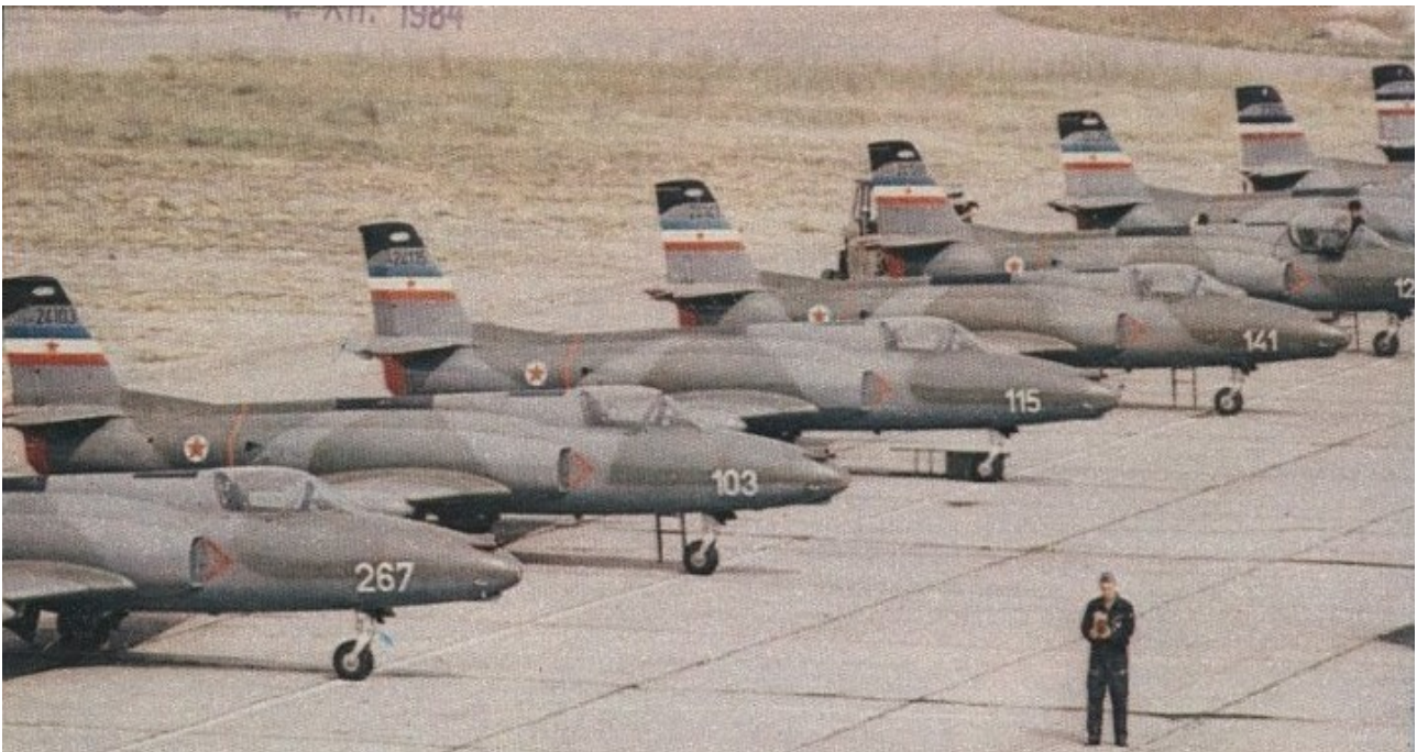
J-21 Jastreb lineup at Cerklje Air Base