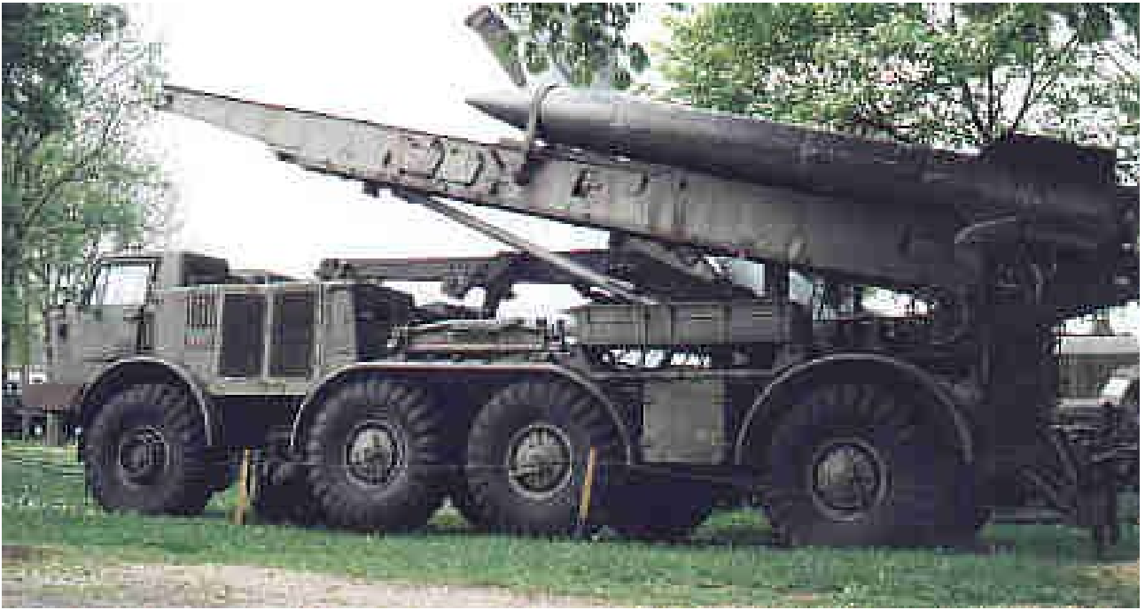
Luna-M / Frog-7