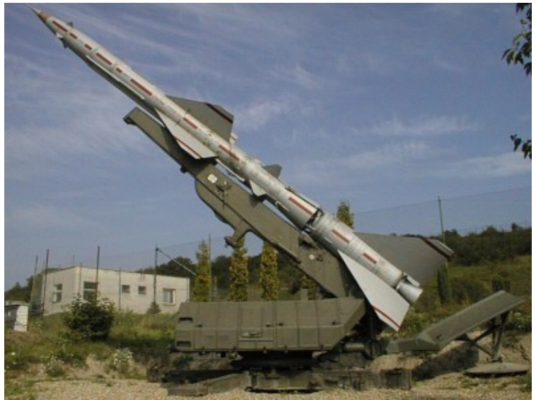
S-75M Volhov / SA-2F Guideline