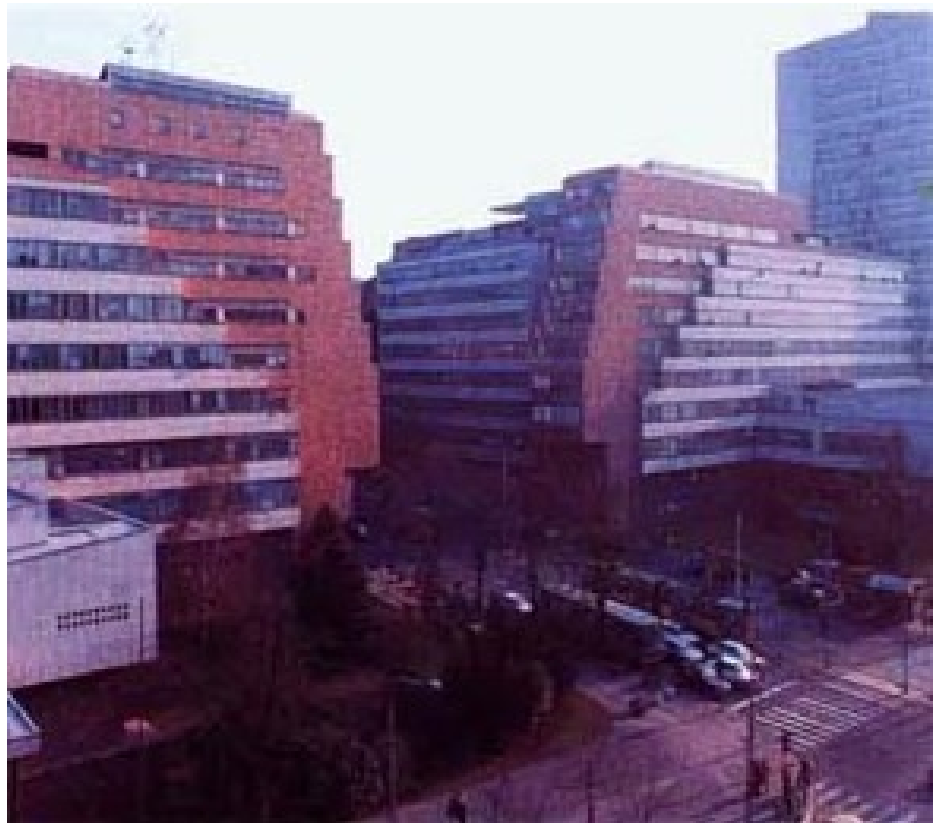
Ministry of Defense, Belgrade