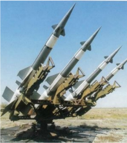
S-125M Neva / SA-3B Goa