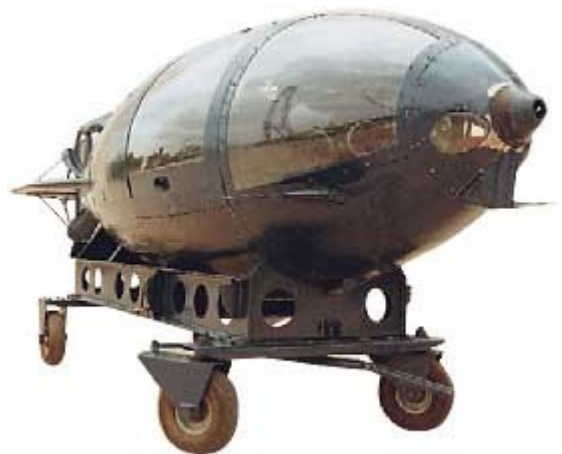
Mala class swimmer delivery vehicle