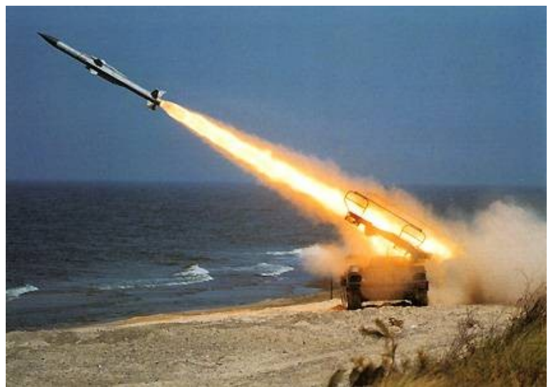
Kub-M / SA-6 missile launch