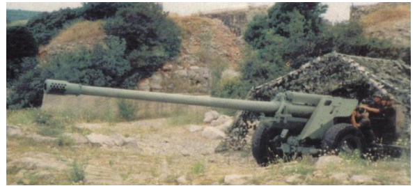
Coastal Artillery (130mm)