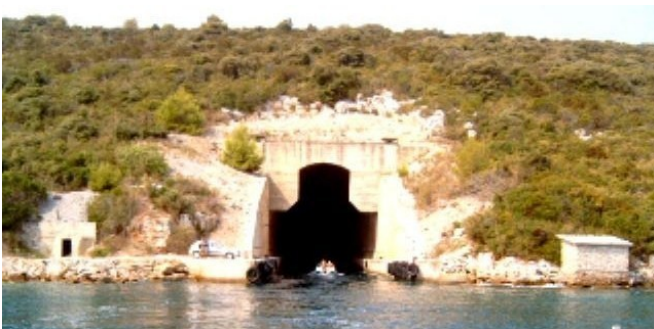
Boat bunker at Dugi Otok island