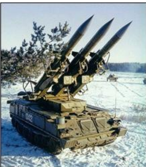
Kub-M / SA-6